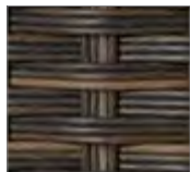
612 TAPESTRY BROWN