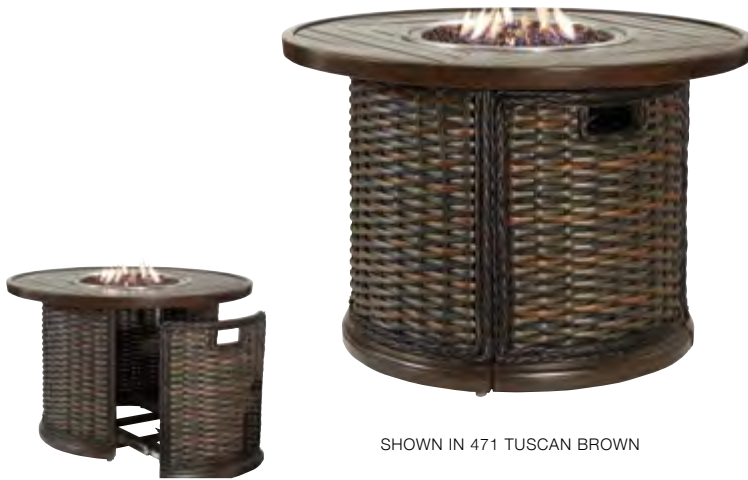
SHOWN IN 471 TUSCAN BROWN

Slide out drawer for gas tank. Gas tank not included.