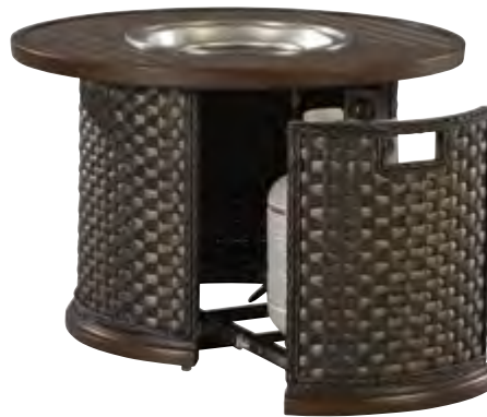
SLIDE OUT DRAWER GAS TANK NOT INCLUDED