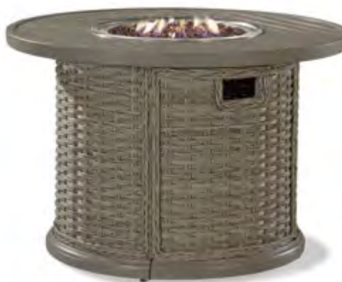
SHOWN IN OYSTER