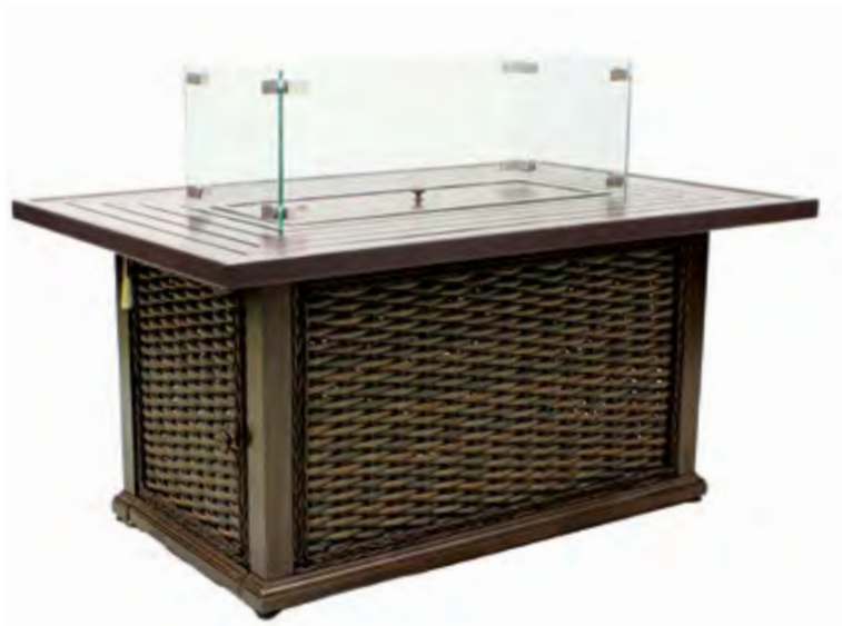
SHOWN IN 471 TUSCAN BROWN