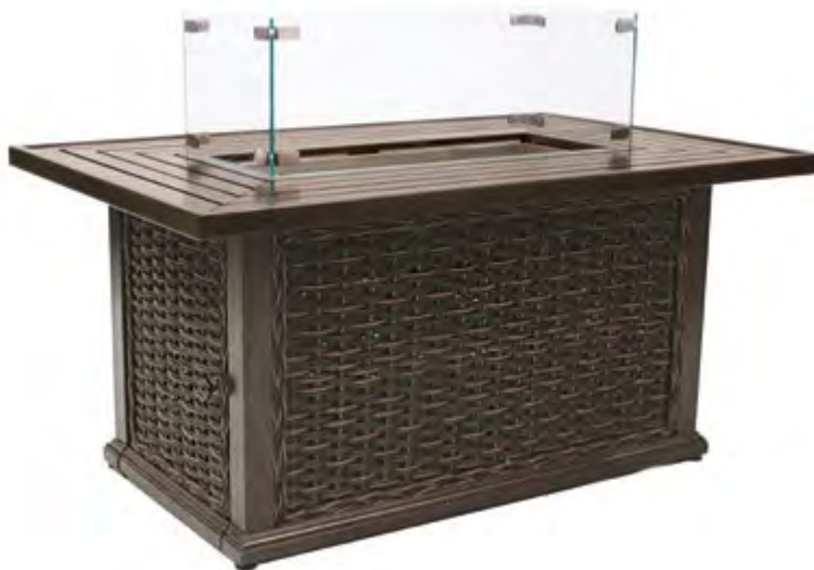
SHOWN IN TAPESTRY BROWN